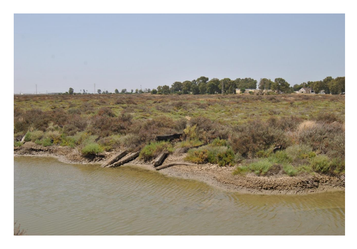
Figure 2: View of "Los Caños" in Shipyard of La Carraca with deposits of timber, Cádiz. Private collection of Ana Crespo Solana. Pictures taken by Ana Rita Trindade.

Besides previous fragmentary research, it can be said that three big enigmas still remain unanswered: Where, how and with what natural, social and economic resources were the Spanish ships in the Early Modern Era built? Or, where were these ships built? Where did the timber come from? And, most important, can we use the above two points to define the Iberian ship? Classical studies give information about these three enigmas. But, at the moment, it is not possible to build a map of the provenance of timber in Spain together with the species that were used merely by using historical sources. According to the information at our disposal, much of that timber, like that used for building the ships' hulls came from the forests in Northern Spain and was mainly oak (Goorman, 1997: 68-108). However, much wood was also imported from Northern Europe. And we still have to analyse the timber that was used in other areas of Iberia, like Andalusia, and even, in the colonies. Only an analysis that connects submerged archaeological sites (wrecks), the wood which remains deposited in the areas belonging to these historic shipyards, as the "timber Cemetery" of the Caños de la Carraca (Sewers) in Cadiz, with a dendrochronological study of the Iberian Peninsula, will let us advance our understanding of historical processes related to forest resources and shipbuilding.