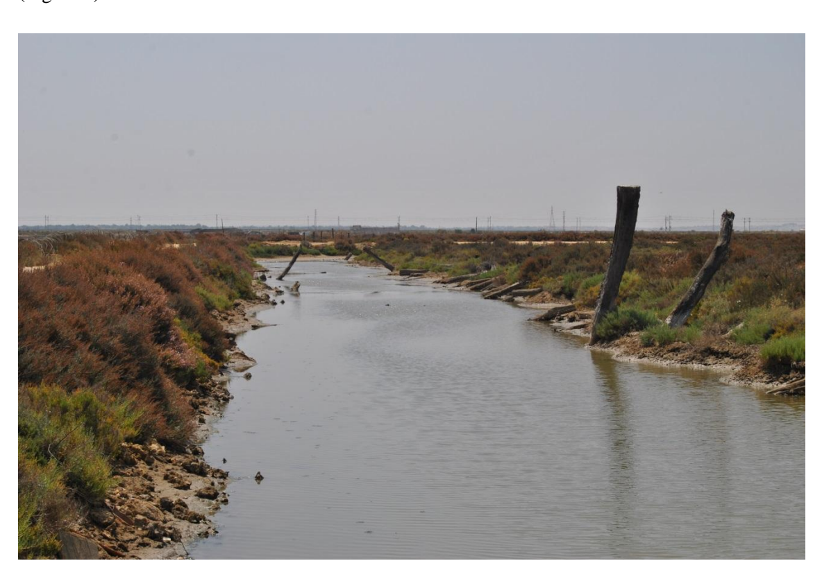
Figure 1: View of "Los Caños" in Shipyard of La Carraca, Cádiz. Private collection of Ana Crespo Solana. Pictures taken by Ana Rita Trindade.