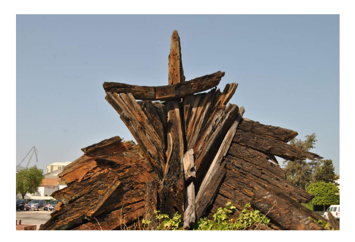
Figures 3: Rests of timber from a frigate of 1791. "Caños de la Carraca", Shipyard in Cádiz. Private collection of Ana Crespo Solana.